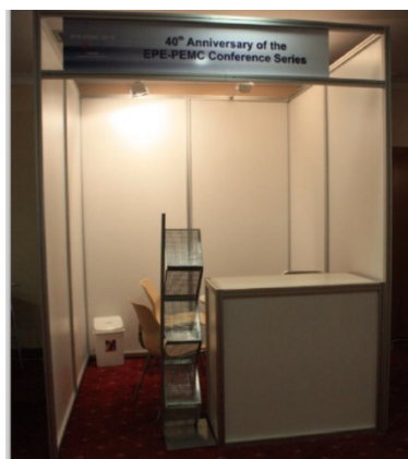
Type 2x2 (4 m 2 )