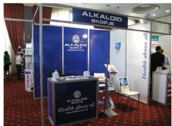
Type 3x2 (6 m 2 )